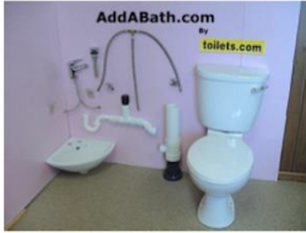
Add A Bath Model A Optimum Size 40" x 40"