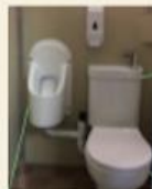
Model B Add A Bathroom