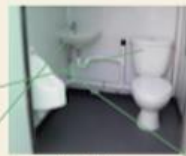
Model A Add A Bathroom