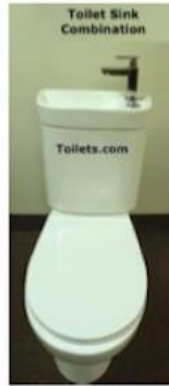
Add A Bath Model B Optimum Size 28" x 38"