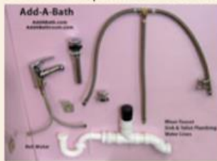
Same Common Components Plus Automatic Shut off Faucet for Cold Water